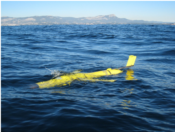
Figure. 1: Sea Glider

The instrument moves slowly and undulators up and down through the water column